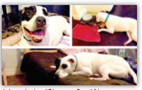
Jake enjoying "Gimme a Break" in a volunteer's home