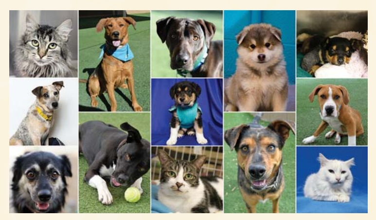
Some of the wonderful animals rescued from rural areas this year -- all have been adopted.

Gila County is 1000% (if there can be a 1000%) happy as can be with our relationship with AAWL. When we needed assistance and direction, it was your organization that came out to Gila and offered us your hand in partnership. It is because of our partnership that we are able to move our animal care operations toward our goal of adopting all available animals.