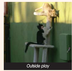
Example of kitten that would have been euthanized just because